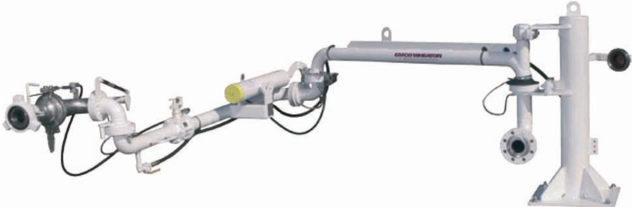
Shown design with emergency release system

Bottom transfer loaders provide extended reach that makes them ideal for applications where a vehicle cannot be accurately spotted.